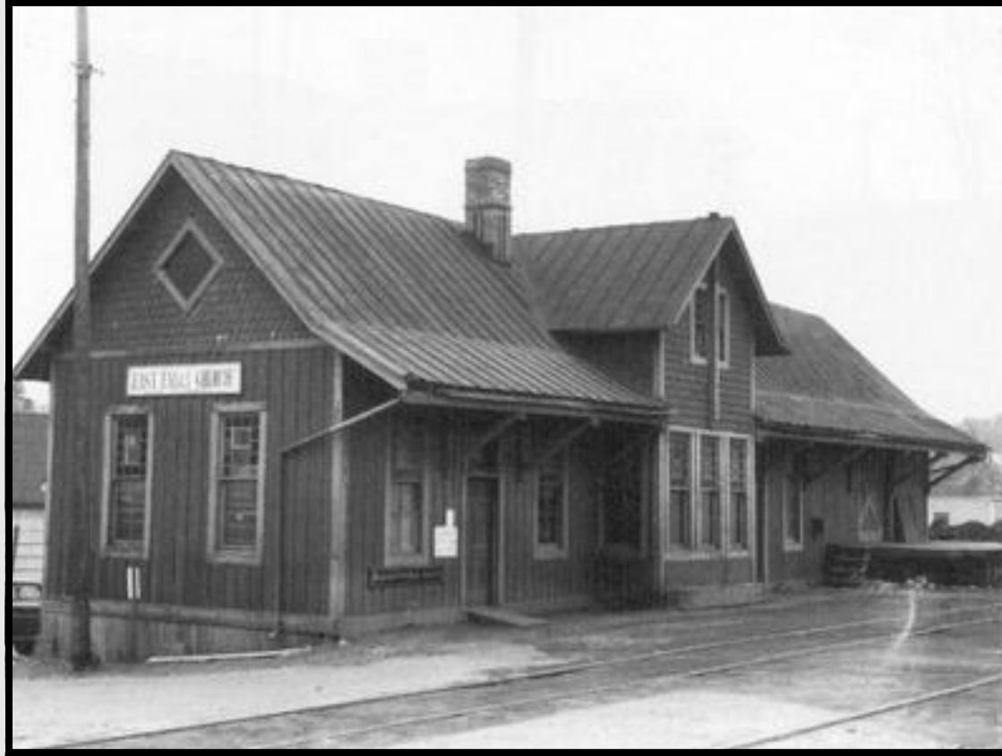
East Falls Church train station, 1966. In 1894, the Southern Railway purchased the rail line and constructed the station shown above. The Washington and Old Dominion Railroad operated that station until 1967. Removed, 1970.