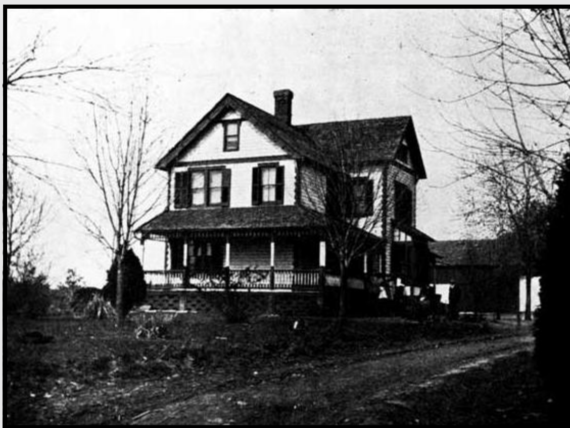
The George Crossman House from Charles Stewart's A Virginia Village , 1904. The structure is located on Underwood Street.

In the 18th Century, Falls Church was a rural woodland village located at the crossroad of the Alexandria-Leesburg and Little Falls-Fairfax turnpikes and served as an important resting spot for travelers on their way to or from Leesburg, Virginia. East Falls Church, which developed on the eastern edge of the village, was ceded to the Federal government for the creation of Washington, D.C. in 1791, but reverted to Virginia in 1846.