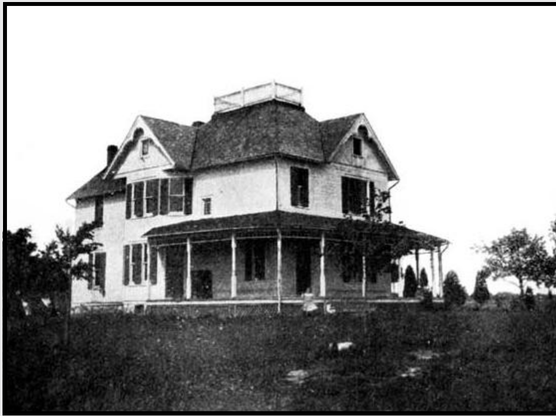
The Barksdale House from Charles Stewart's A Virginia Village , 1904. The structure is located on the north-east corner of Washington Blvd and Roosevelt Street.